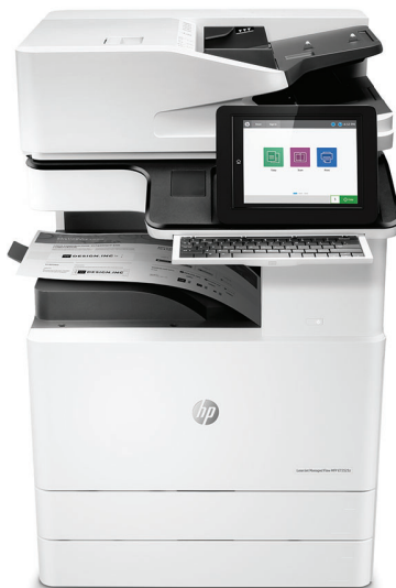
HP LaserJet Managed Flow MFP E72525z

*Purchase of optional paper trays and output accessory availability varied by device