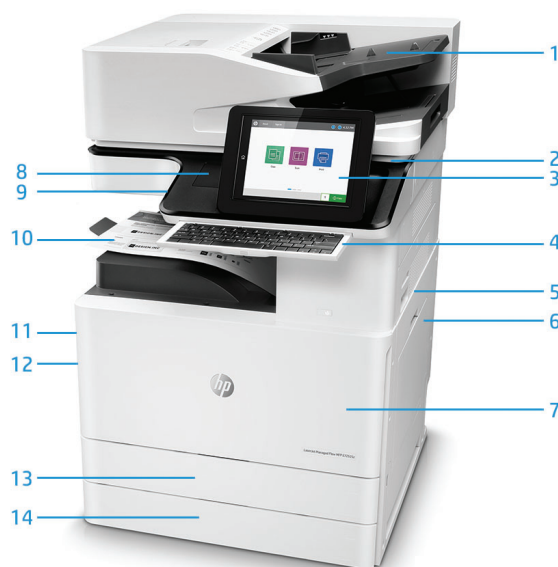
HP LaserJet Managed Flow MFP E72525z