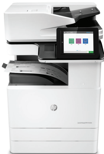
HP LaserJet Managed MFP E72525dn

Businesses that stay ahead don't slow down. It's why HP built the next generation of HP LaserJet MFPs—to power productivity with a streamlined design that delivers premium quality, maximum uptime, and the strongest security. 1